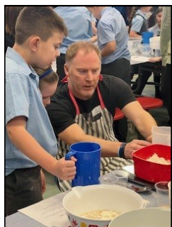
Bread making fun!